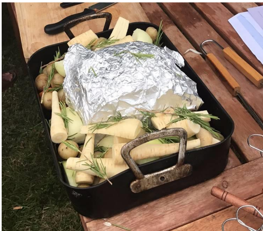
Figure 1 food prep before the shoot