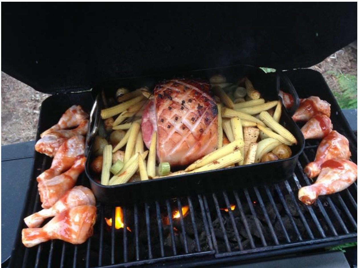
Figure 3 Roast Ham with veg and potatoes and a little chicken on the side